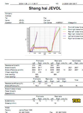
Customized Test Report