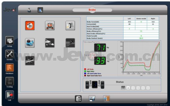
Brake Testing Database